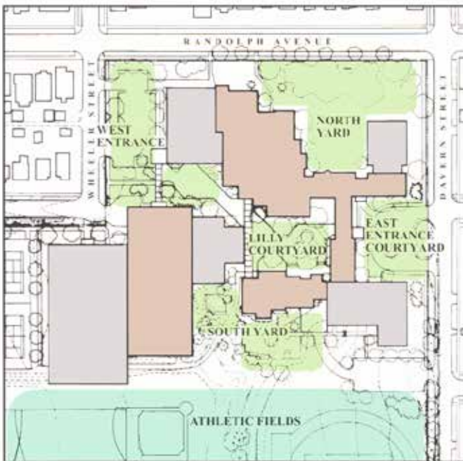
RANDOLPH CAMPUS EXTERIOR SPACE USE

*Project completed under previous name: Dober, Lidsky, Craig and Associates, Inc.